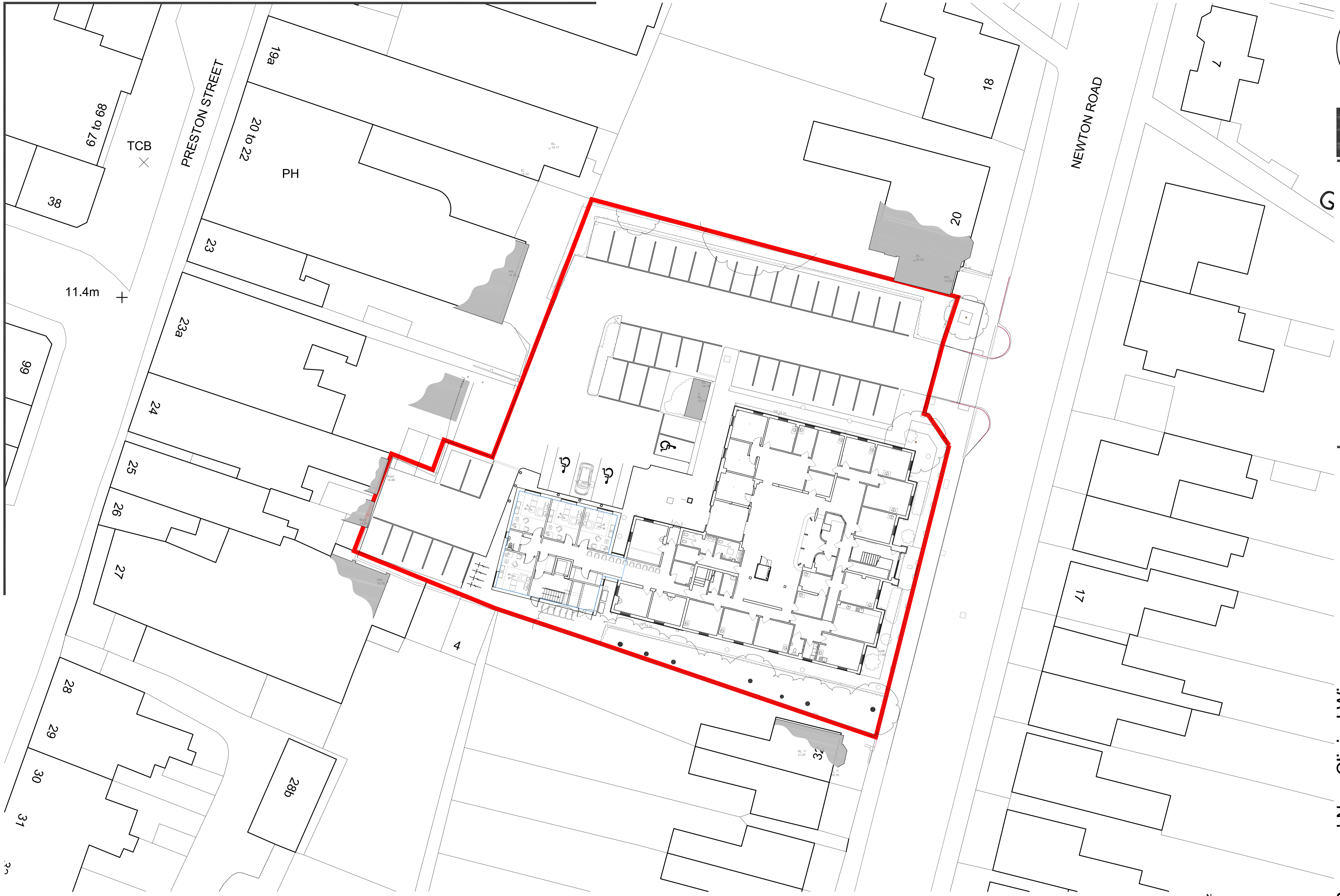
Site Plan as Proposed 1:200